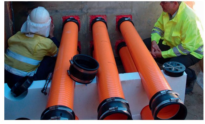
Installation of Hateflex flexible conduits to wall inserts.