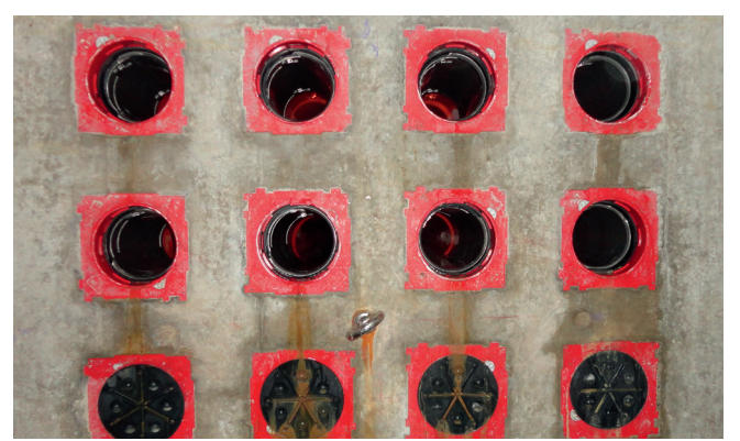
HSI 150-K2 after concreting casement.