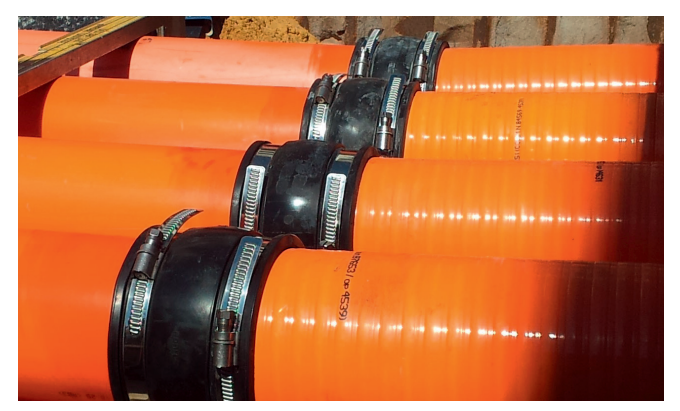
Connection of flexible conduits to rigid conduits.